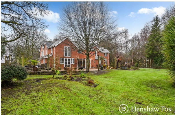
The Sanctuary | £1,250,000 Salisbury Road, Plaitford, Hampshire SO51 6EE